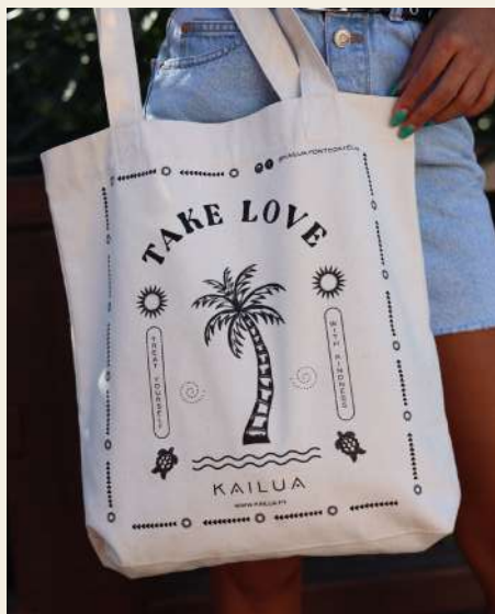
TAKE LOVE TOTE BAG