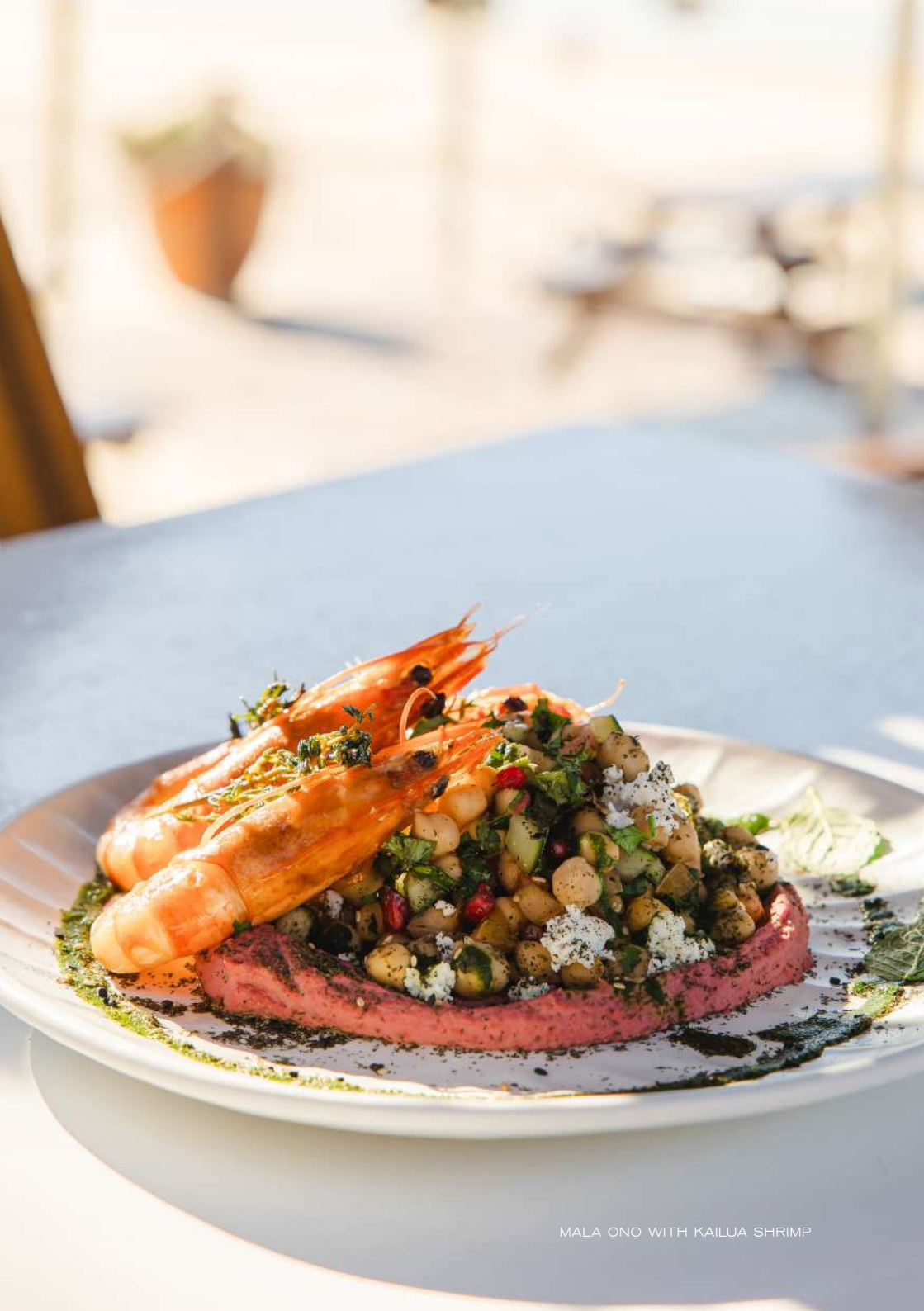
MALA ONO WITH KAILUA SHRIMP