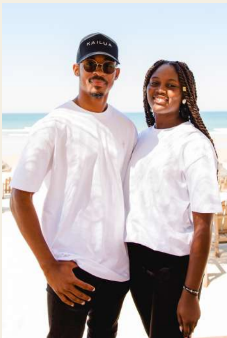
T-SHIRT MULHER/HOMEM LAAU PAMA