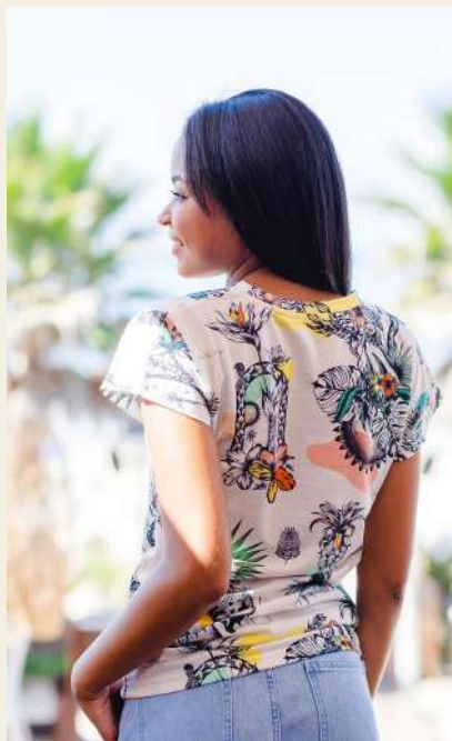
WAIHO'OLU WOMEN'S T-SHIRT

You can find our collection at the restaurant or at www.kailua.pt