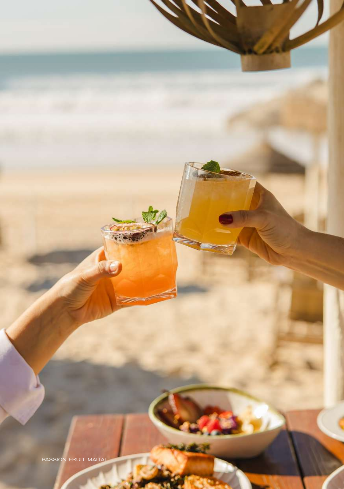
PASSION FRUIT MAITAI