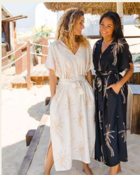
MĀLIE DRESS AHIHI DRESS